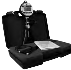
WICP-M500 Pneumatic Pump Kit (shown with CPG 1000)