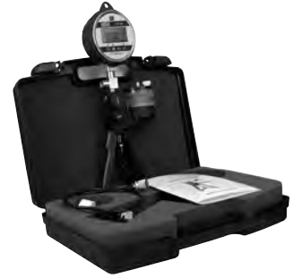
WICP-H10K Pneumatic Pump Kit (shown with CPG 1000)