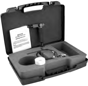
WICP-L100 Pneumatic Pump Kit

WIKA pneumatic and hydraulic test pumps are high performance hand operated pumps that allow the user to generate both pressure and vacuum for precise testing of pressure instrumentation including transmitters, pressure switches and pressure gauges