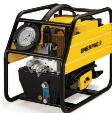
TQ700-Series Torque Wrench Pumps