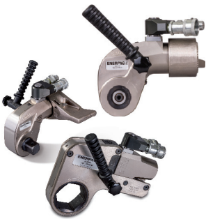
S & W-Series Torque Wrenches