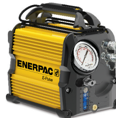
E-Pulse Pumps Torque Wrench Pumps