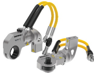
RSL-Series Torque Wrenches