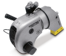
DSX-Series Torque Wrenches