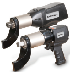
ETW & PTW-Series Torque Wrenches