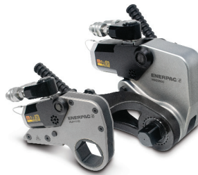
HMT-Series Torque Wrenches