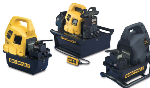
Z-Class Torque Wrench Pumps