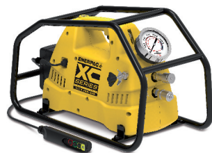
XC-Series Battery Torque Wrench Pumps